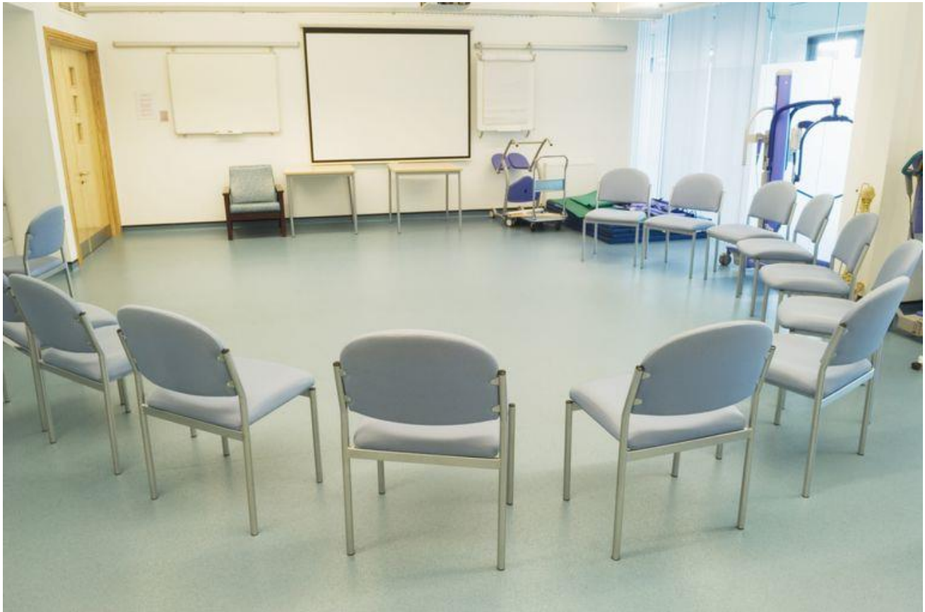
Each Group Is Self-Supporting.